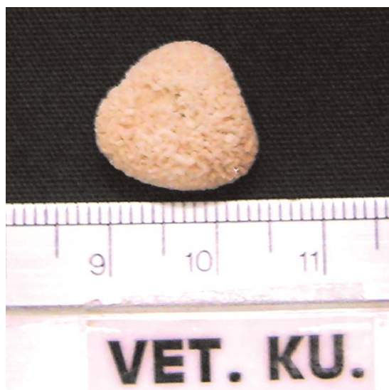
Oxalate bladder stone from a cat in Bangkok