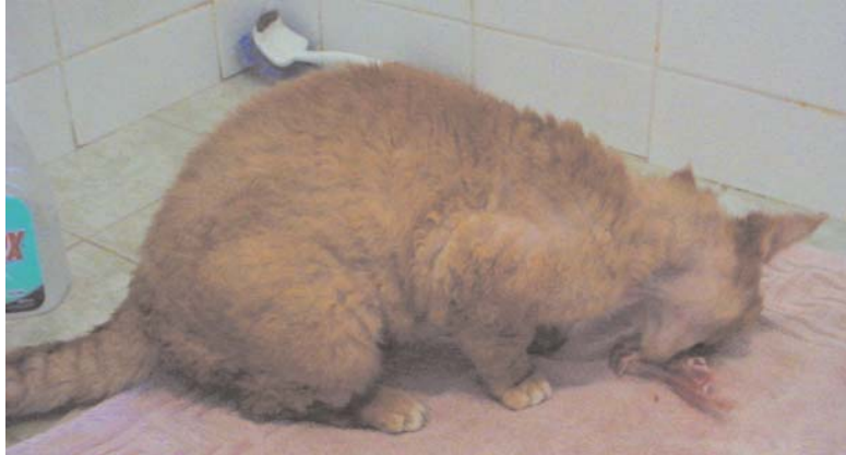
A happy Devon Rex eating a lamb cutlet in the shower recess