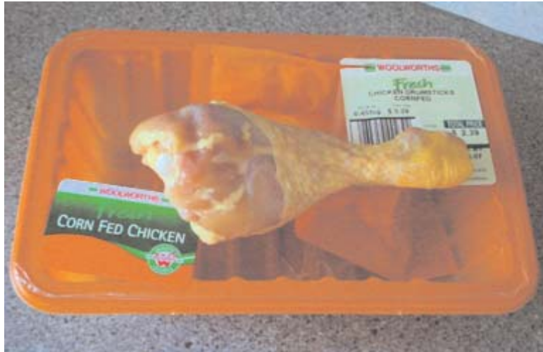
Chicken drumstick – cat food for the new millennium!