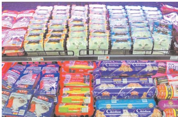
Range of "pet meat" currently available in supermarkets

sufficient antioxidants e.g. certain types of fish) (Watson et al , 1973), thiamine deficiency (from sulphur dioxide in fresh meat treated with sulphite preservatives, fresh fish containing thiaminases or meat that had been cooked without addition of supplementary thiamine) (Malik & Sibraa, 2005) (Figure 2). Experimentally, it was known that when cats were fed certain commercial diets, commercial dog food, or vegetarian diets, they would develop retinal degeneration due to taurine deficiency (Markwell et al , 1995), but this rare because of the large amount of fresh meat typically available to cats in Australia.